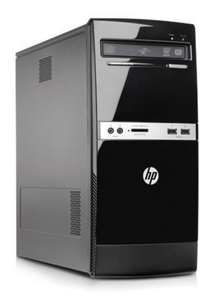
HP recommends Windows® 7.

Take full advantage of your small business resources with stylish efficiency at a price that won't break the bank.